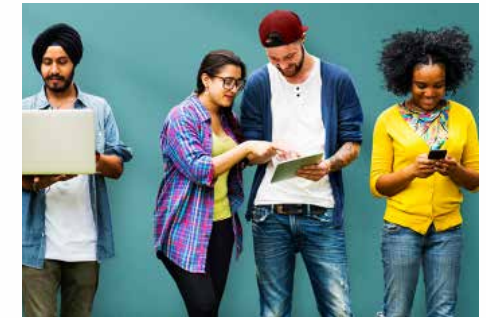
Choosing subjects and courses at 18